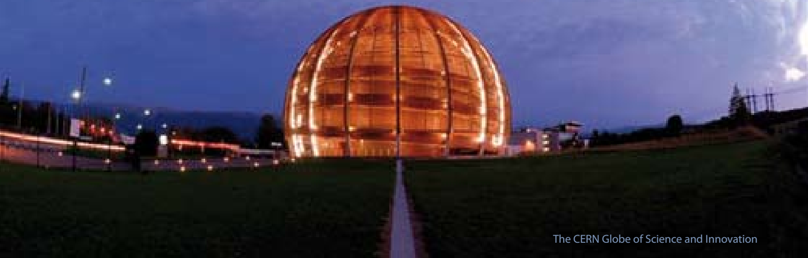
The CERN Globe of Science and Innovation